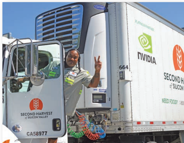
Supported by a Community Grant, Second Harvest of Silicon Valley distributes healthy food to families in need at six sites in San Bruno.