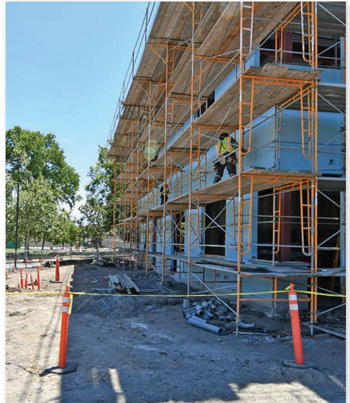
Over the summer, the construction team made significant progress on the facility's construction. The project includes renovations and improvements to City Park Way, the creek, parking, utilities, and the intersection at Crystal Springs Road and Oak Street.